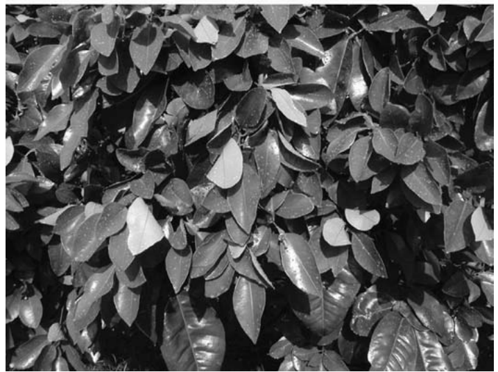
Fig. 2. Profuse flowering when grapefruit tree was hedged in late Dec. 2004 or Jan. 2005 (top) versus flush only from tree hedged in October-November (bottom) after 2 hurricanes in the Fall of 2004.

leaves survived, apparently because more leaves provided higher carbohydrate levels to ultimately support flower buds. In the spring of 2005, initial fruit retention generally appeared good, but final fruit set may be reduced because of the reduced leaf area on many of the trees. Appropriate leaf samples were collected and potential reductions in carbohydrate levels will be determined for a future report.